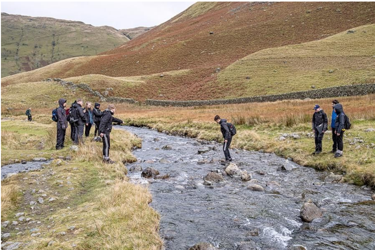
Figure 2 - A photograph of students carrying out fieldwork in a river