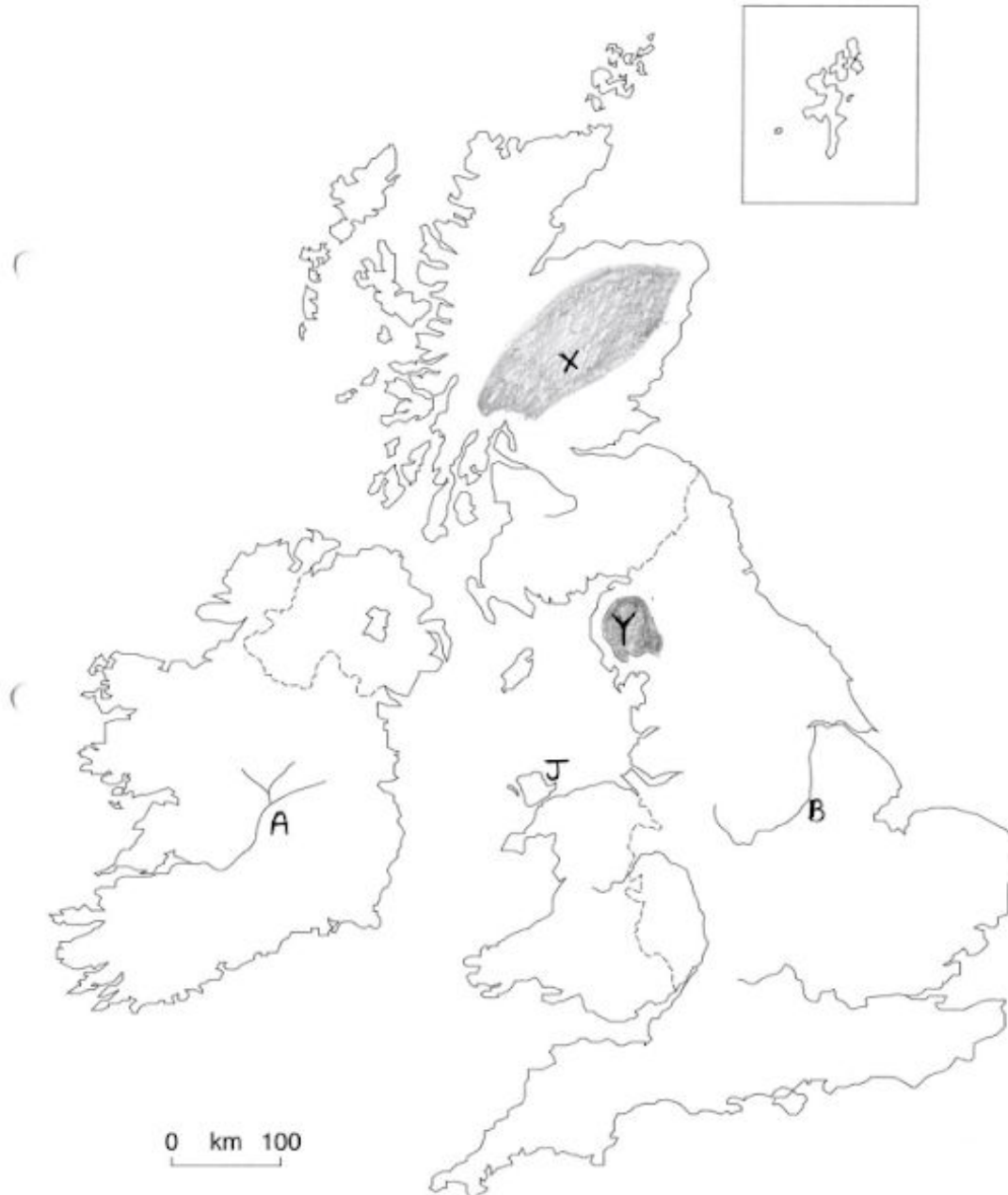
Figure 1 - A map of the United Kingdom